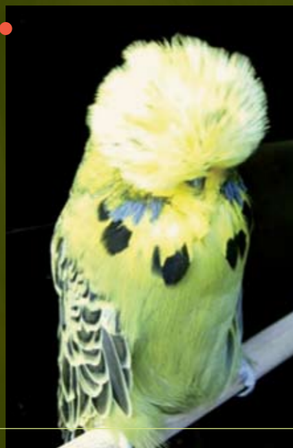
Blue Texas Clearbody- split ino. Never seen before in this quality