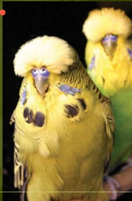
Extreme long and long-feathered gray spangle cock