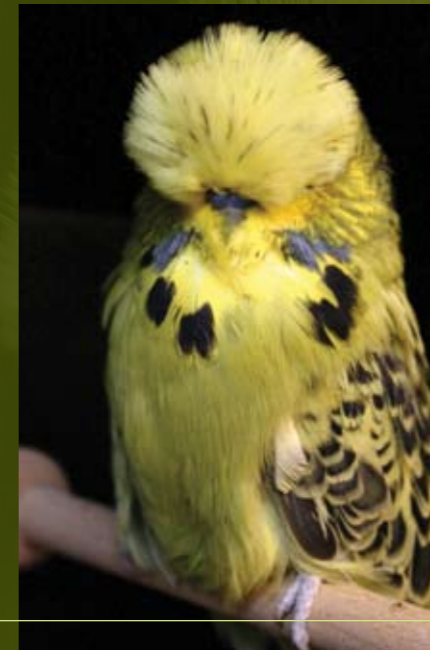
Wonderful graygreen dominant pied hen